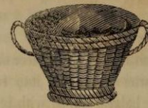
A BASKET PINCUSHION.

Emery bags are often made in this manner, but of course much smaller; not exceeding the size of a large real strawberry.