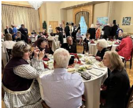
The image is from the Saturday evening event at the Dayton Woman's Club